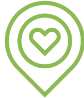
Serve the Community