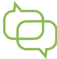
Share Your Story