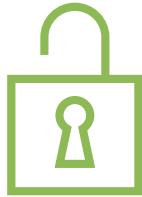
Freedom from Strongholds